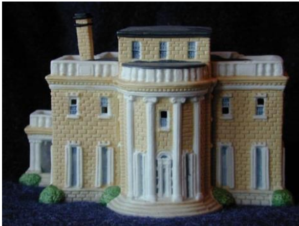
Potter- Haan Mansion (2002)