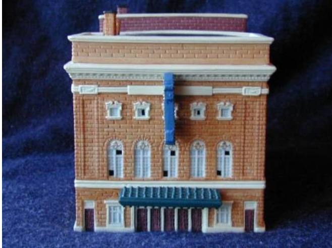
Long Center/ Mars Theater (2004)