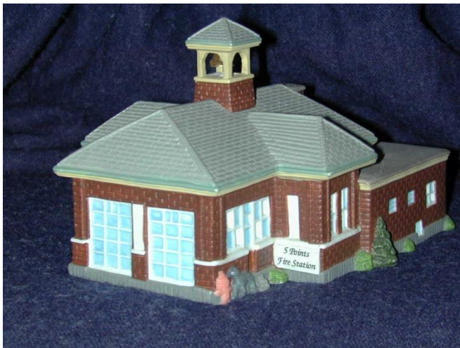
Five Points Fire Station (2000)