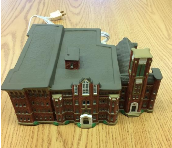
St. Elizabeth Hospital and Chapel (2006)