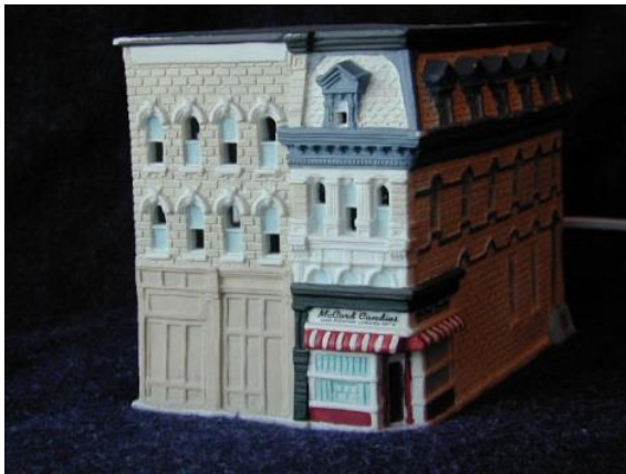
McCord's Candies (2001)