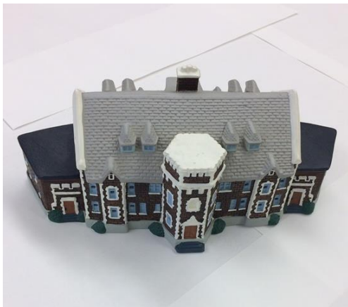
Knights of Pythian Home (2006)