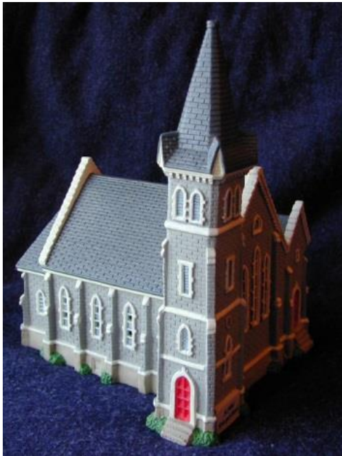
St. John's Church (2004)