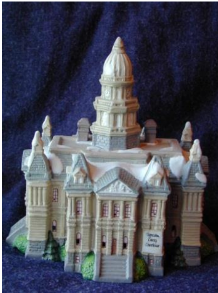
Tippecanoe County Courthouse (1997)

The Tippecanoe Treasures series was coordinated by TCHA from 1997-2006 as a fund raising project. Most of the building models are no longer in stock, but occasionally can be found at local antique shops, online or are given back to TCHA for resale. To learn what is currently in stock at the TCHA History Store, call 765-567-2147 or email HistoryStore@tippecanoehistory.org