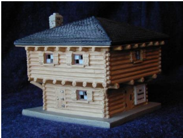
Fort Ouiatenon Blockhouse (2003)