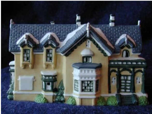
Moses Fowler House (1997)