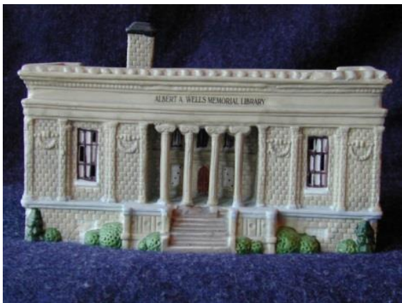
Albert A. Wells Library (1999)