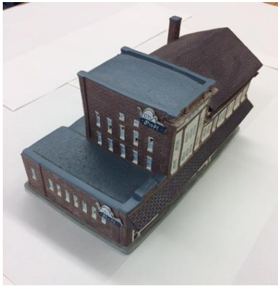
Von's/ Harry's Chocolate Shop (2005)