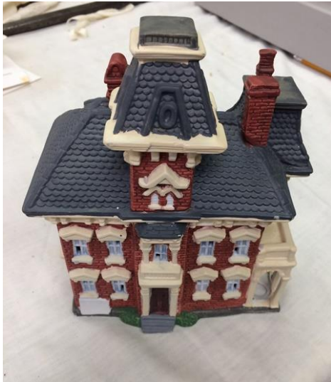
Cyrus Ball Mansion (1998)