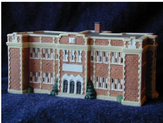
Jefferson High School (2000)