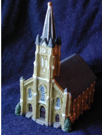
St. Mary's Cathedral (1999)