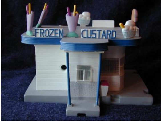
Frozen Custard (2002)