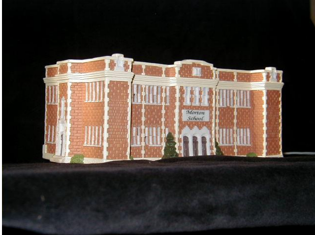
Morton School (2001)