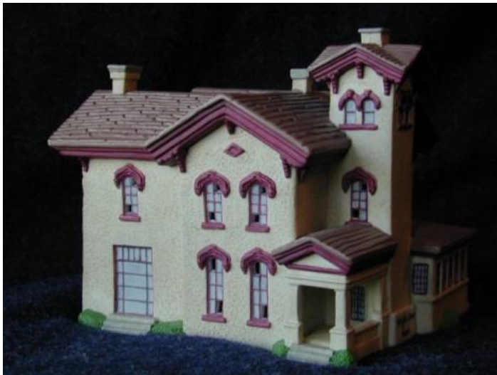
Wright- Sousa House (2003)