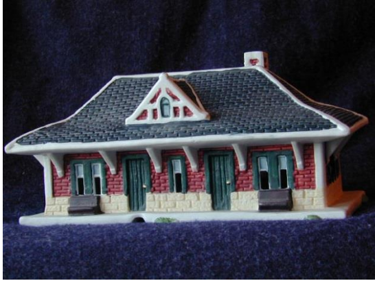
Big Four Depot (1998)