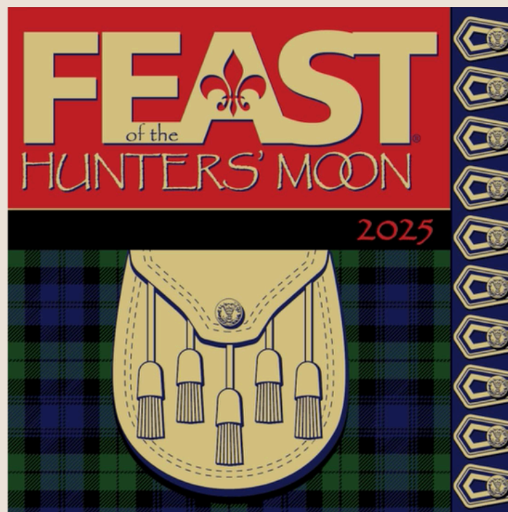
Artwork for the 2025 Feast of the Hunters' Moon