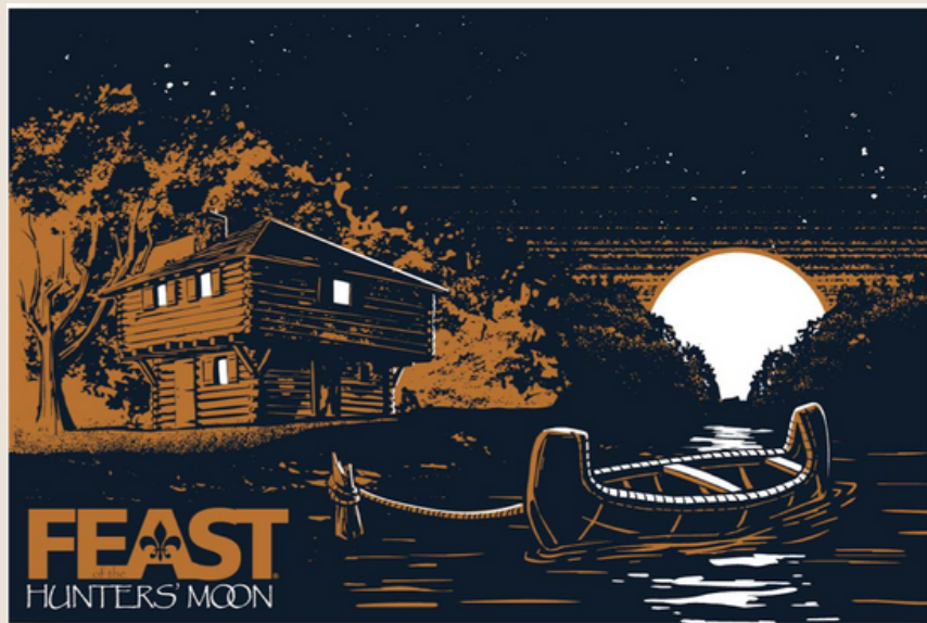
Artwork for the 2024 Feast of the Hunters' Moon