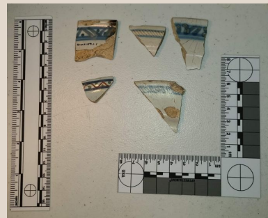
Sherds of Pottery from Fort Ouatennon