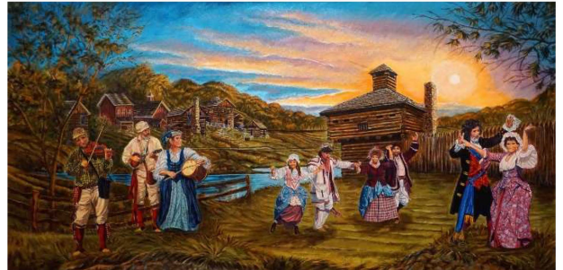
Fortress of the Heart

Feast of the Hunters' Moon reenacts that celebration, as depicted in