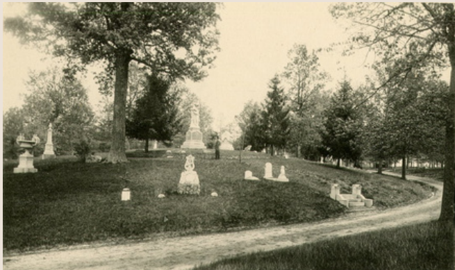
Spring Vale Cemetery

In December 1868, the Spring Vale Cemetery Association was organized, and a 150 acre tract two miles northeast of the city in the Longlois Reserve was purchased. It was laid out into 35 sections, in the rural cemetery style. Hear all about ghosts, murders, accidental deaths, and more. This walking tour is self guided, and a map will be provided. Docents will be stationed around the cemetery to talk about various burials.