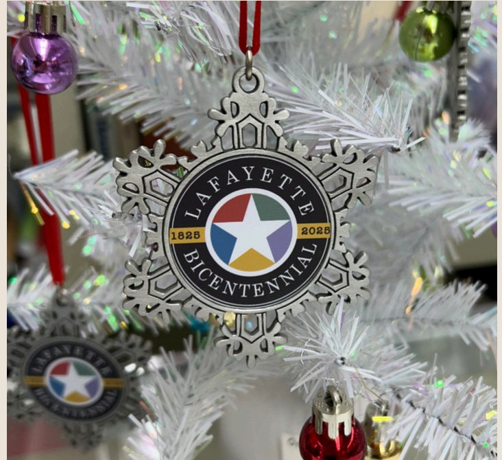
Lafayette Bicentennial Christmas Ornament Featuring Bicentennial Logo

All proceeds benefit the continuation of TCHA events and programs .